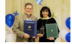
Arts Group Award COLOURS Committee