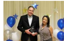
Business Award Bakersfield Pipe & Supply