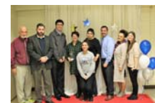
Education Group Award Grimmway Academy