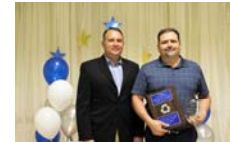
Special Recycle Award The Scotts Company